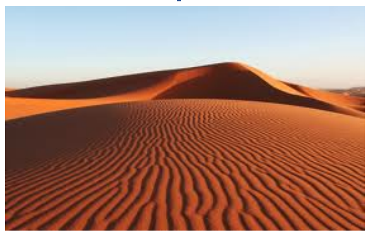
The spice must flow!